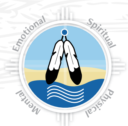
Visual Design by: Kimberly Haws, Ponca. dba Big Moon Ideas .

Please send changes or corrections to: Lesa Westra, White Eagle Behavioral Health Center Lesa.Westra@ihs.gov